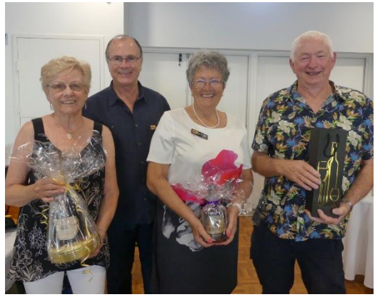
Members & Lucky Door Prizes – 4pm show