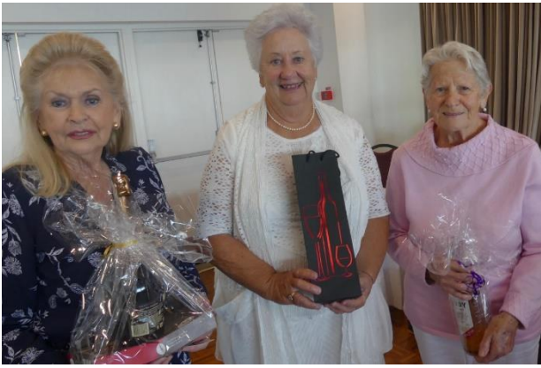
Members' & Lucky Door Prizes Noon Show